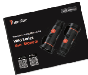
User manual (x1)