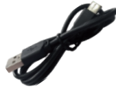
USB cable (x1)