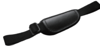
Hand strap (x1)